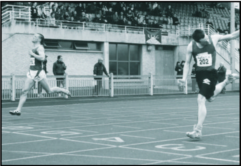
UL Athletics Club in action