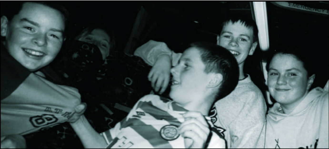
Some of Celtic's younger supporters