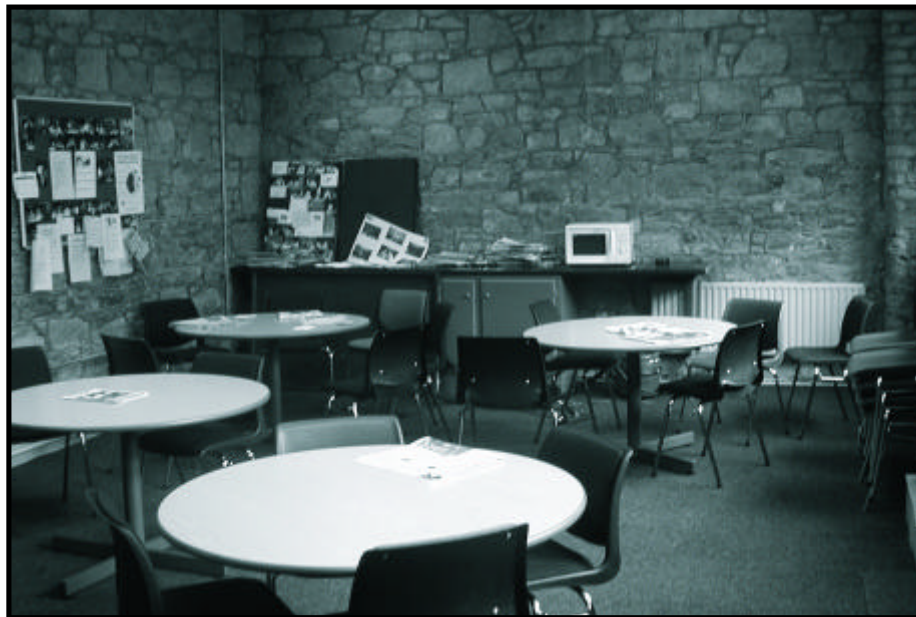
Hide from scary first years in the postgrad centre