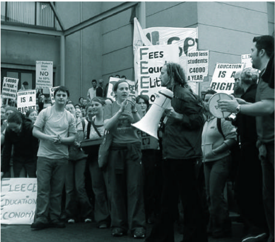
ULSU Sabbatical officers at the fees protest