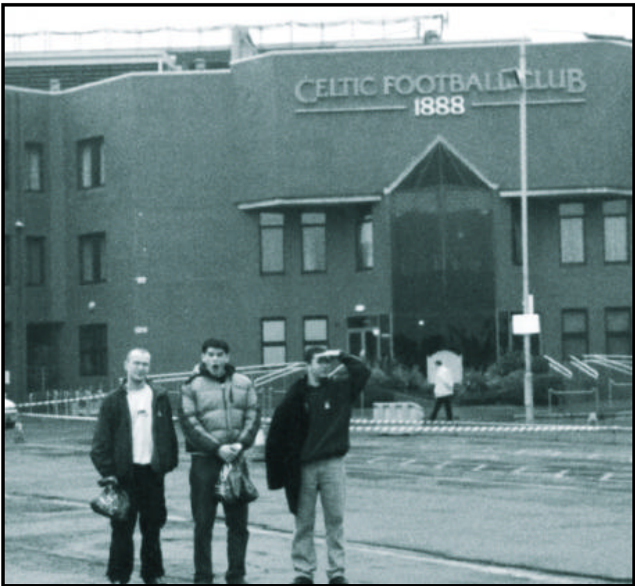
Members of the Celtic Supporters Club in Glasgow

During the three week break after the exams again 52 people travelled over to Watch our Bhoys in Green and White play Dunfermline. Among our group were six youngsters from an initiative being run by the access office, called sport for success, and their two minders, which our club sponsored on the trip over to see