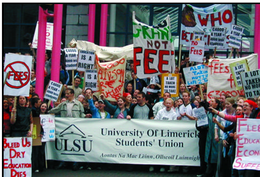
Student Protesters at the fees protest in Limerick city

Colourful placards with slogans such as "once the land of saints and scholars, now the land of rates and robbers", 'please no fees' and '4k no way' dominated the procession and students chanted as they voiced their opposition to Minister Noel Dempsey's plan to introduce tuition