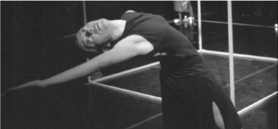
in Japan. lobby.