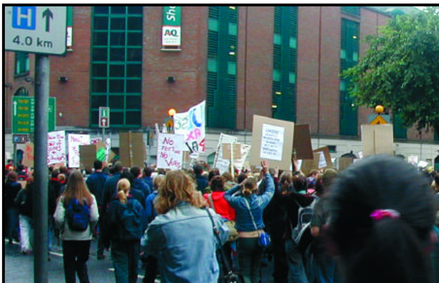
Students march up O Connell street

Anger among students was provoked earlier this year when the minister introduced a massive 69% increase in third level registration fees putting many students under ever increased