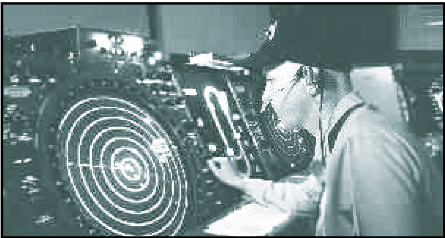
Air traffic controllers in action

While most passengers believe that the pilot is in control of the destiny of the flight this is not the case. The pilot can't change direction, height or speed without permission of a traffic controller. A flight plan is submitted to operations before every flight and the pilot must follow the plan. The controllers believe that it is they that actually fly the planes. The pilots merely implement their decisions. This is obviously open to debate!!